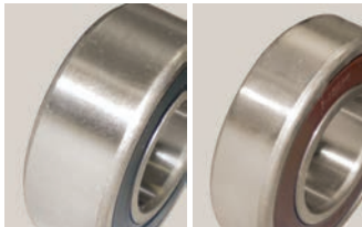
Heavy Duty Standard